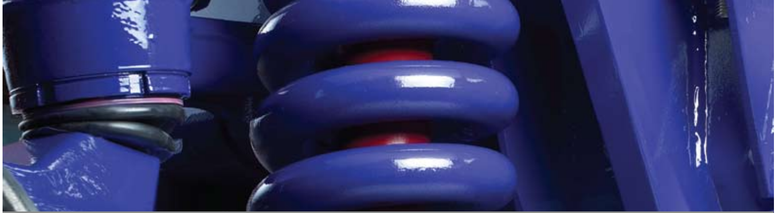
▲ Cutting Edge Mobility Systems